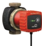
Calio-Therm S NCV K