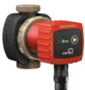
Calio-Therm S NCV S