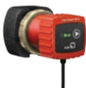
Calio-Therm S NC K