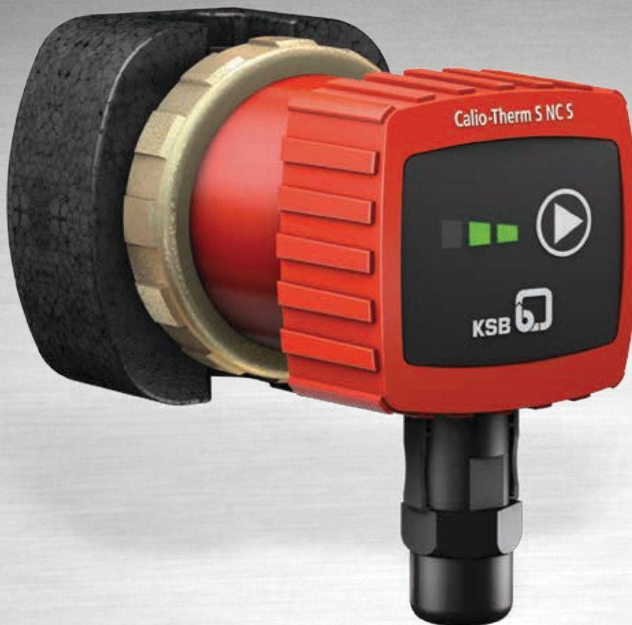
Calio-Therm S NC S